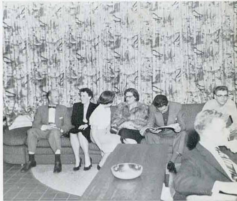
Many visitors gathered at the first open house, this group enjoying them- selves in the lounge during the even- ing's activities.