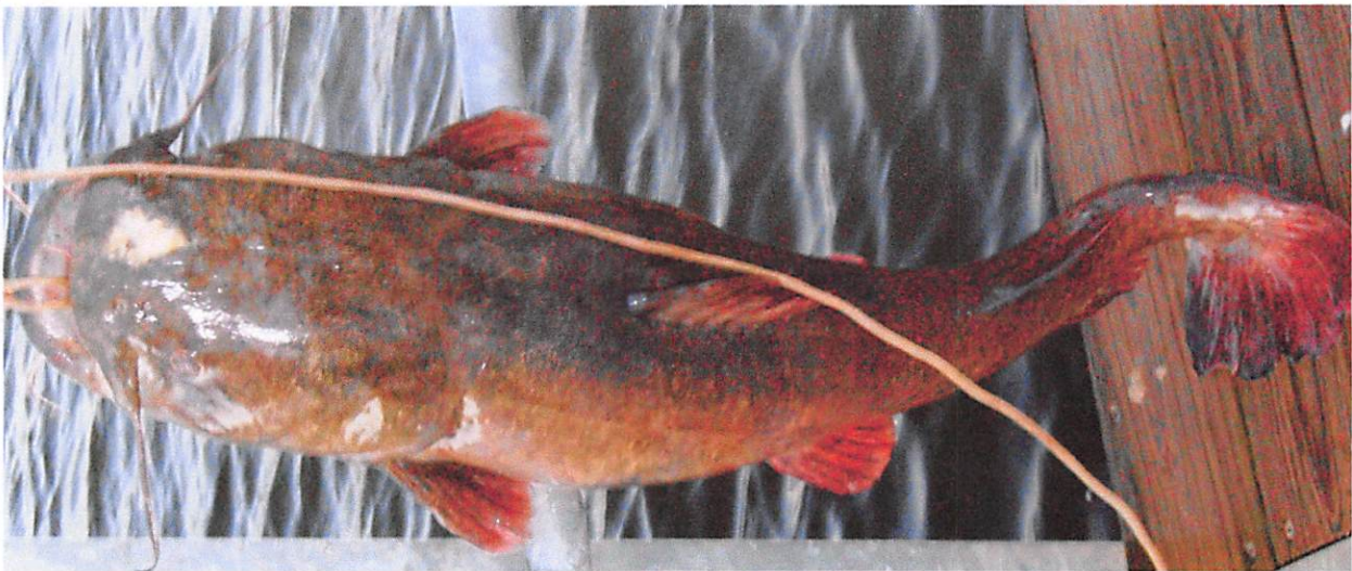
6. Pylodictis olivaris (Flathead Catfish)