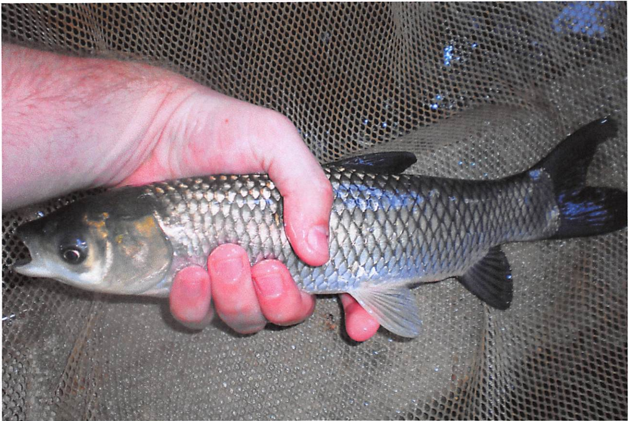
1. Ctenopharyngodon idella (Grass Carp)