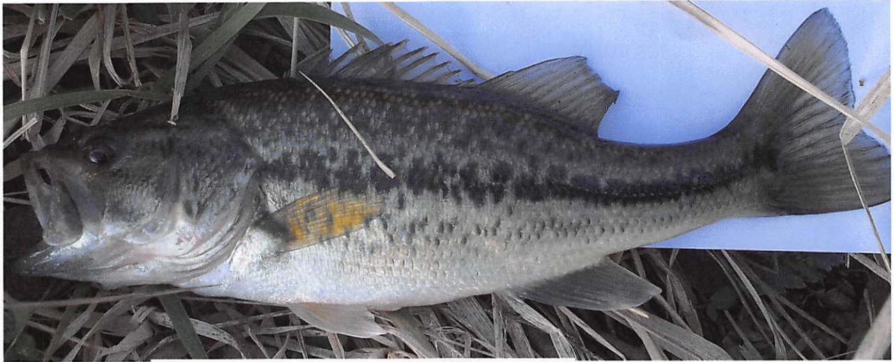
10. Micropterus punctulatus (Spotted Bass)