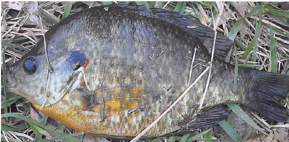
9. Lepomis microlophus (Redear Sunfish)