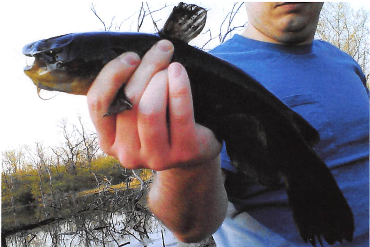
4. Ameiurus natalis (Yellow Bullhead) (note the creamy/white barbels)