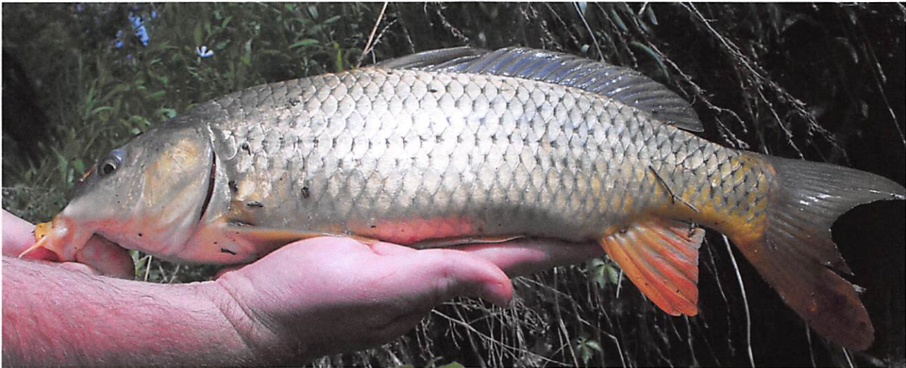
2. Cyprinus carpio (Common Carp)