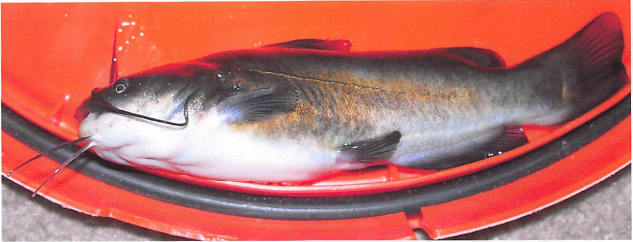
3. Ameiurus melas (Black Bullhead) (note the dark chin barbels)