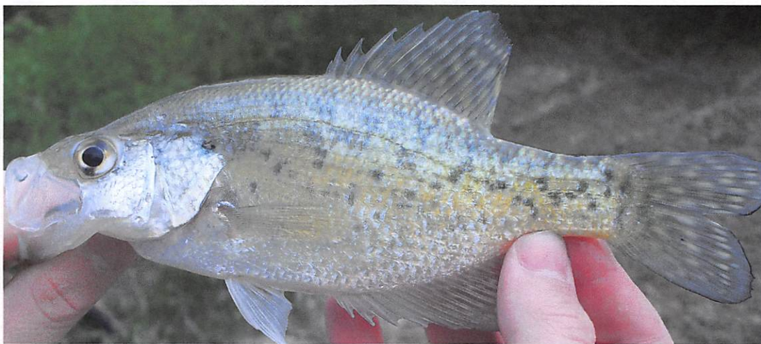
12. Pomoxis annularis (White Crappie)