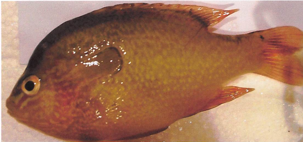
8. Lepomis megalotis (Longear Sunfish)