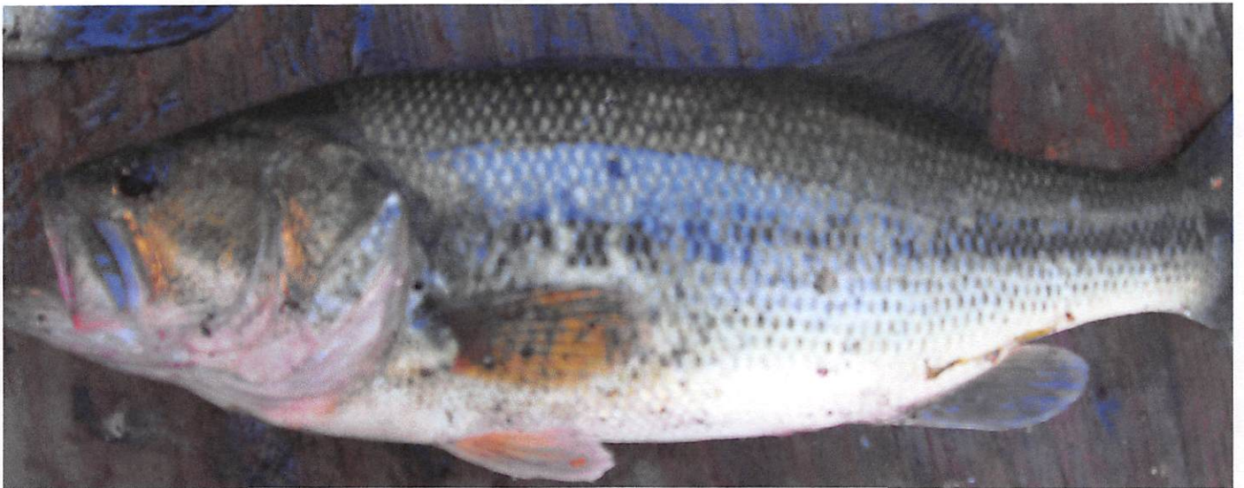
11. Micropterus salmoides (Largemouth Bass)