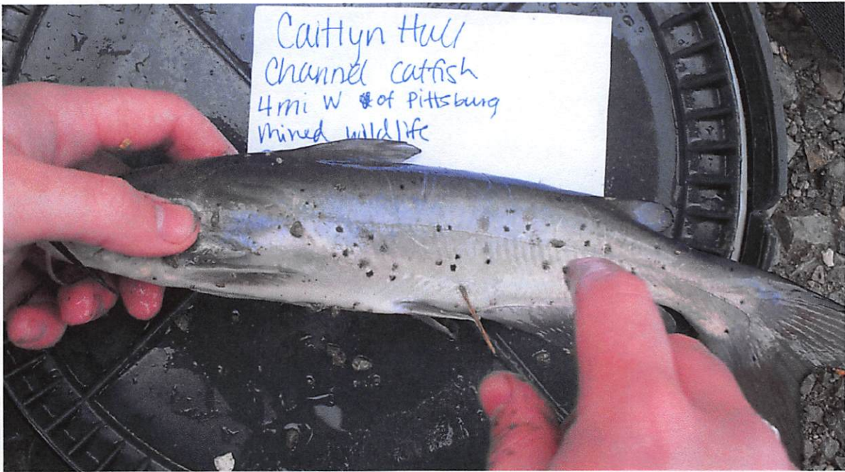
5. Ictalurus punctatus (Channel Catfish)