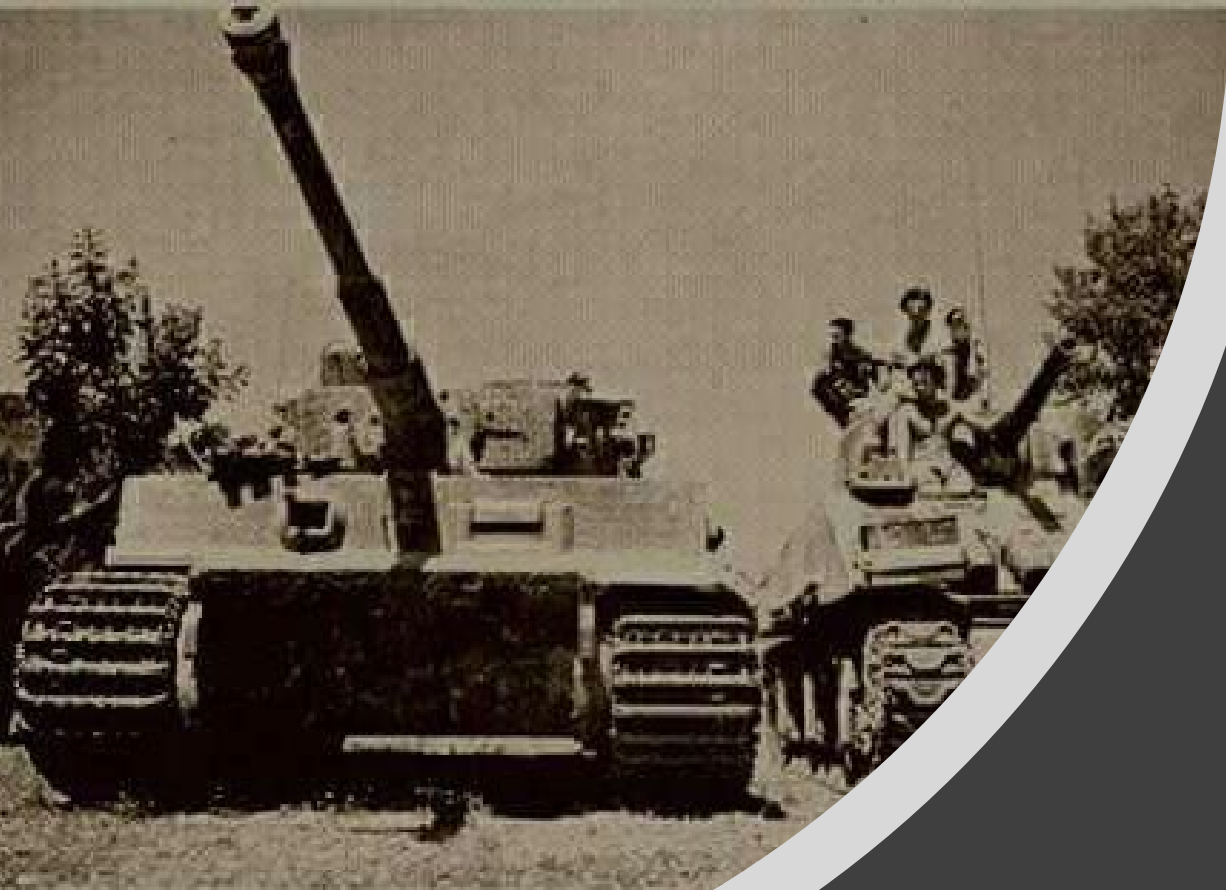
The Tiger tank captured intact by the British alongside one of 4 Armoured