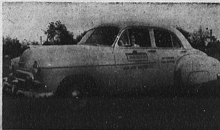
Shirley Campbell receives instruction in driving.