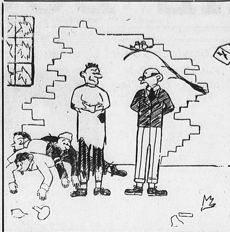
Frankly, Snitzman, under the circumstances, we feel you should discontinue your experiments.