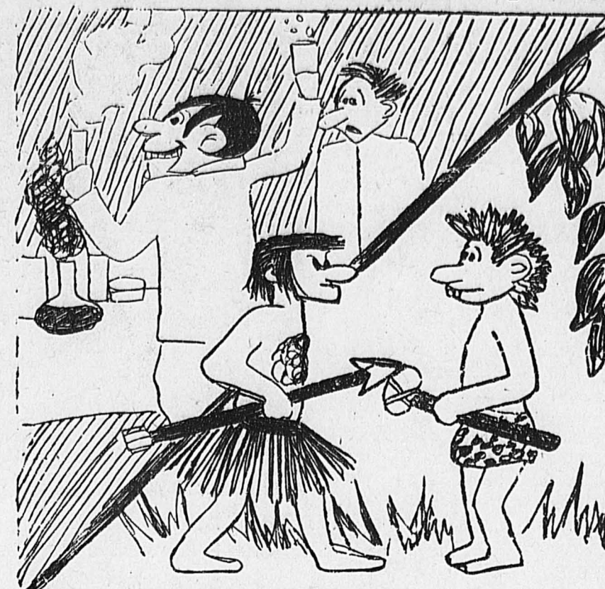
Einstein says that World War IV Will be fought with spears.