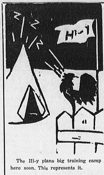
The H-1 plans big training camp here soon. This represents it.