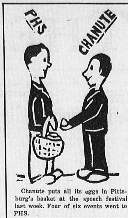
Chanute puts all its eggs in Pittsburg's basket at the speech festival last week. Four of six events went to PHS.