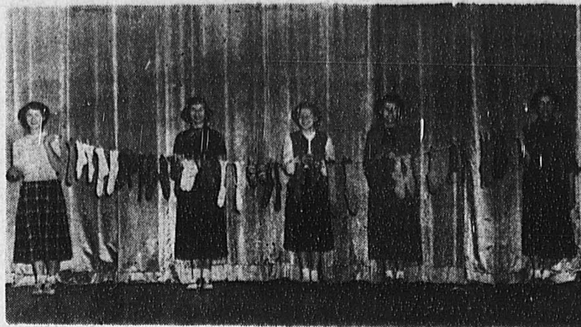
EIGHTY PAIRS OF SOCKS, all colors, sizes and shapes were the contribution of 200 Y-Teen girls of PHS, in their recent Christmas campaign, "Socks for a Foreign Friend."

The project is a special event during World Fellowship week. Each girl was asked to bring a pair of clean, used socks. After putting a quarter in the toe of one stocking and her address in the other toe each girl hung her contribution on a clothes line strung across the auditorium stage.