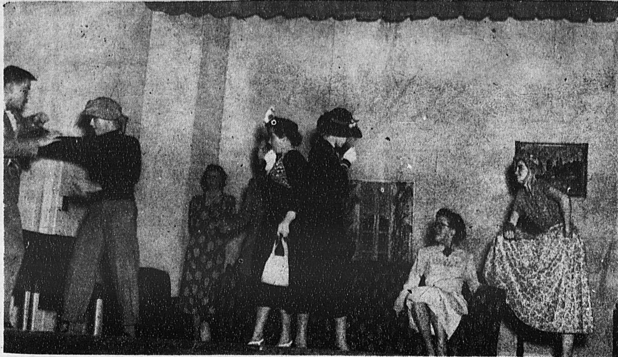
A TENSE MOMENT in "The Henpecked Husband" presented by the Dramatics Class in Senior High School Auditorium.