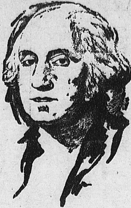
George Washington 1732-1799

"His was the singular destiny and merit, of leading the armies of his country through an arduous war, for the establishment of its independence, of conducting the councils through the birth of a government until it had settled down into a quiet and orderly train; and of unscrupulously obeying the laws through the whole of his career, civil and military, of which the world furnishes us no other example."