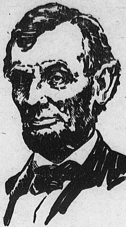
Abraham Lincoln 1809-1865

"Up from the log cabin to the Capitol, One fire was on his spirit, one resolve—