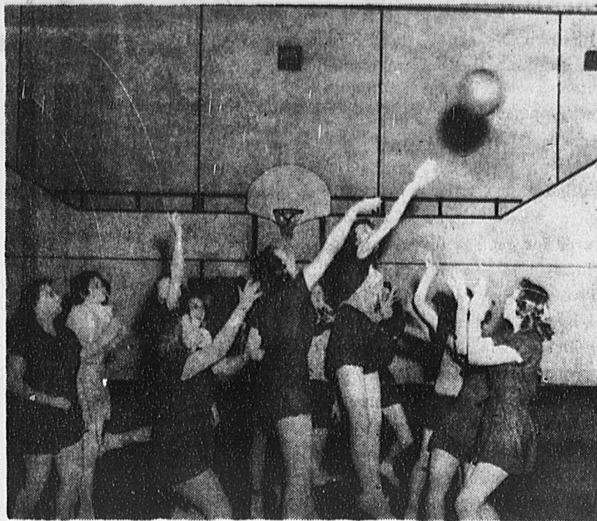
G.A.A. Girls pep it up with a basketball game