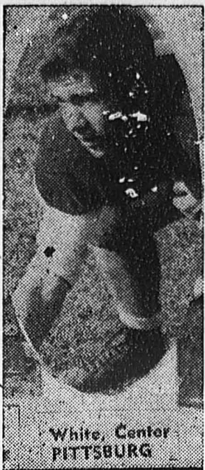
White, Center PITTSBURG