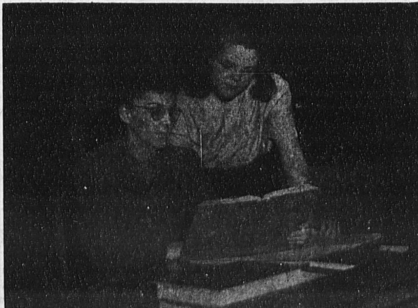
"Foreign language often helps to strengthen the English language."