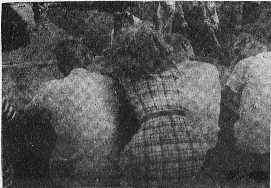
Two may be company and three a crowd but this seems to be a chummy group of four students here.