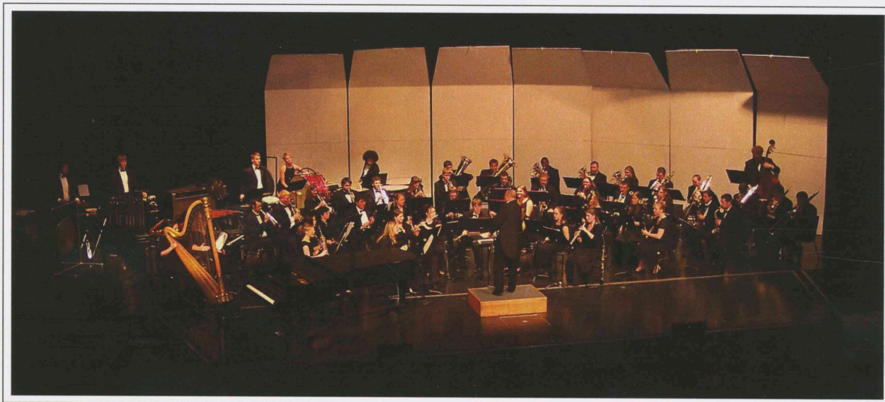
The Pittsburgh State University Wind Ensemble