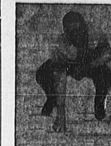
CHUCK GILLILAND FULLBACK 12 POINTS

quarter and was replaced by Bottenfield. "Botts" showed great courage