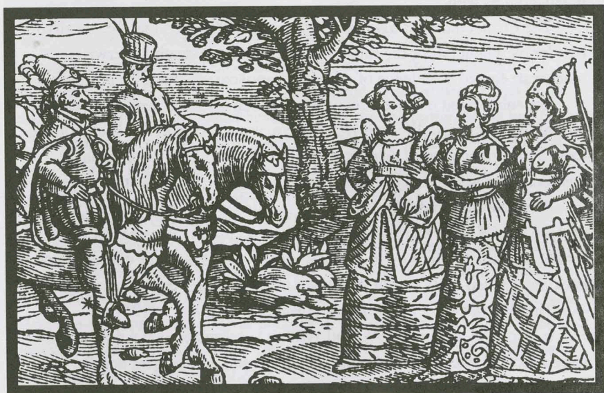
An early 16th century woodcut of the opening episode in the Macbeth story, from a printed edition of Holinshed's Chronicles .