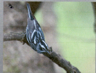
Black and White Warbler