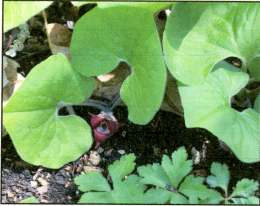
Wild Ginger ( Asarum canadense ) Birthwort Family

Found in rich woodland habitat where flowers are at ground level under leaves. Pollinated by ants and beetles.