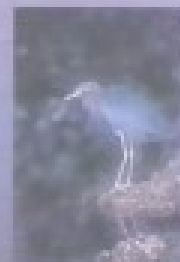
Little blue heron