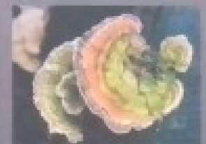
"Turkey Tail" Shelf