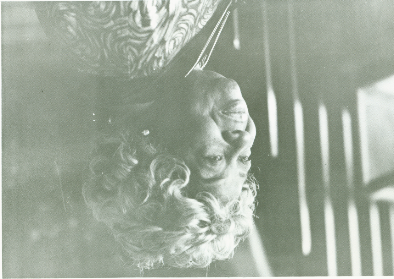
Dr. Eva Jessye

Mrs. Jessye has recently given her extensive personal collection of black music memorabilia to the University of Michigan. She has also been devoted to the cause of racial equality and understanding throughout the world. She started gathering the Eva Jessye Afro-American Music Collection over twenty years ago. It consists of her own mementos and substantial donations from others. Photos of jazz and blues performers are among the collection. Included are also original plays, manuscripts, opera scores, recordings, books, photographers and various objects of art.