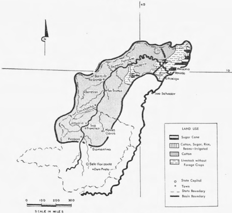
LAND USE OF LOWER AND MIDDLE BASINS OF THE RIO SAO FRANCISCO