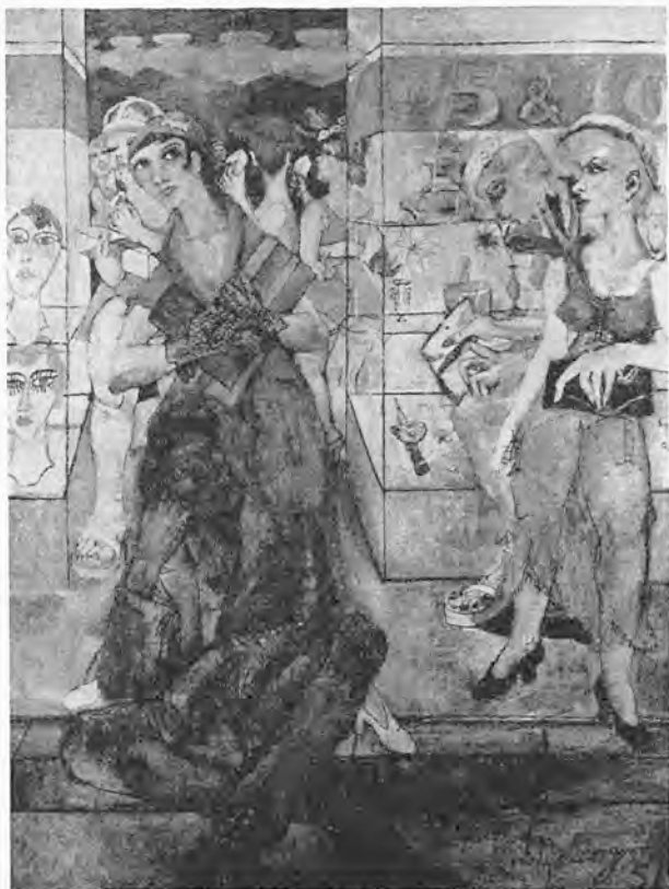
The Passing Show

treachery, sacrifice—all these things are here in the world and they are reflected in art forever also. I have seen Chinese paintings of 600 years B. C. that could have been executed yesterday, they were so freshly close to the earth and to life. Design by man is just as sure and even in its earthly distribution and in its definiteness and excellence as the placing of the stars in the universe.