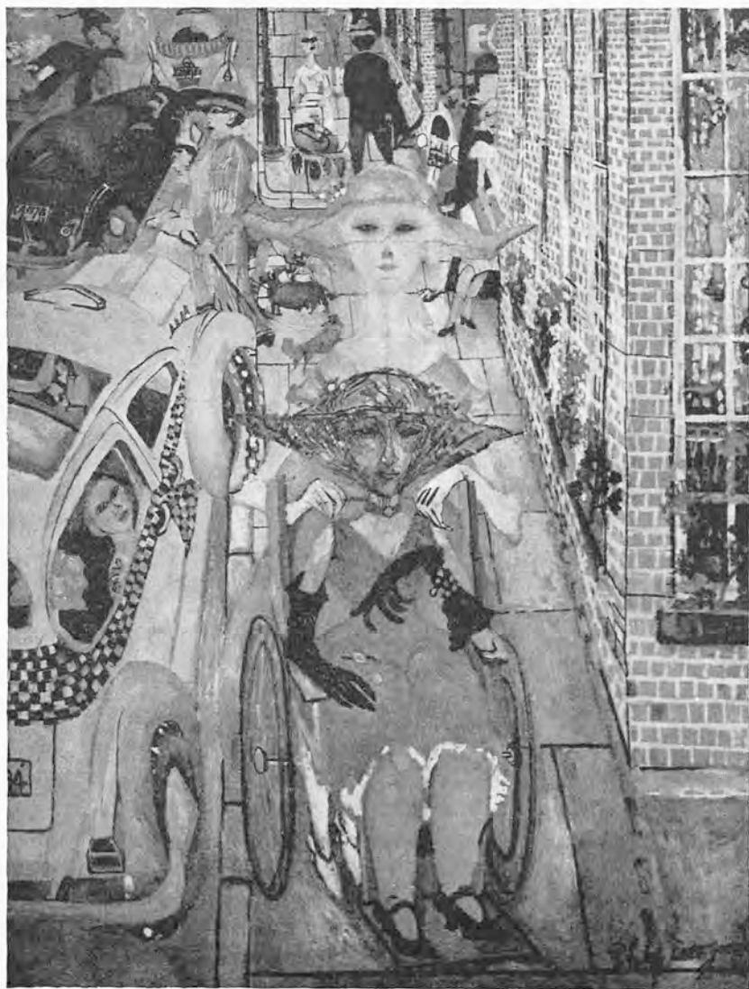
Dowager in a Wheelchair

"The forms, colors, and shapes of nature have been familiar to man since his creation. Man has become associated with these