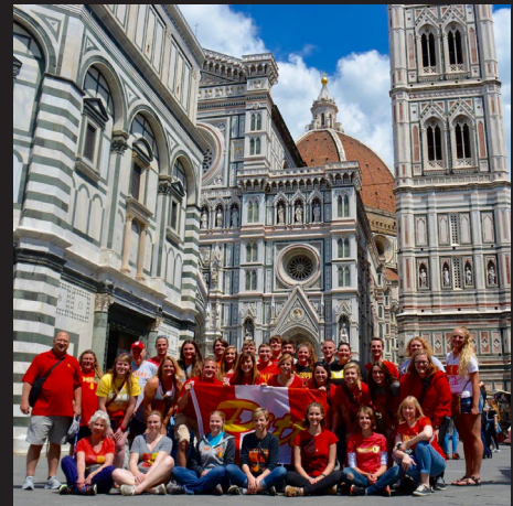
Taking Italy – The study abroad group lines up in front of the Duomo in Florence, Italy.

After Florence, students were given a whirlwind bus tour of Pisa and Cinque Terre on their way to the French Riviera. There, they were able to visit the famous Leaning Tower and explore the Five Cities via train.