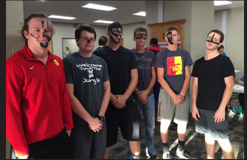
The fearsome warriors of Pittsburg State's Honors College pose for the camera after emerging victorious from round one of Gorilla Games. The defending champions ultimately placed second in the laser-tag event.

Our defending Gorilla Games champions came in second after making it past the first round and defeating the Pitt State ROTC in round two of a laser tag tournament. Many of our members also competed in Yell Like Hell with other activities and groups on campus.