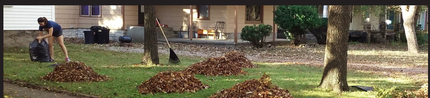
HCA members work their way through piles of leaves during the Pitt Project Saturday, Oct. 29. The Project drew 80 volunteers this year, and 17 projects were able to be completed for Pittsburg residents.

for students to gain community service hours. Each year, volunteers travel to homes in the Pittsburg area to rake leaves, clean gutters, trim shrubs, dig posts and paint.