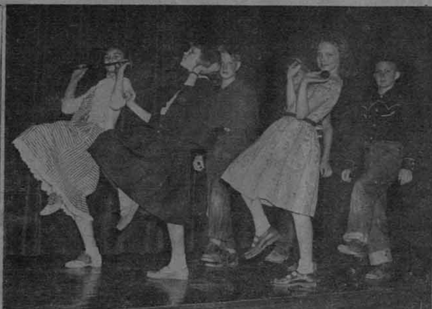
THE DRUM MAJORS shown above will be seen in The Horace Mann Operetta to be presented tonight in Carney Hall.