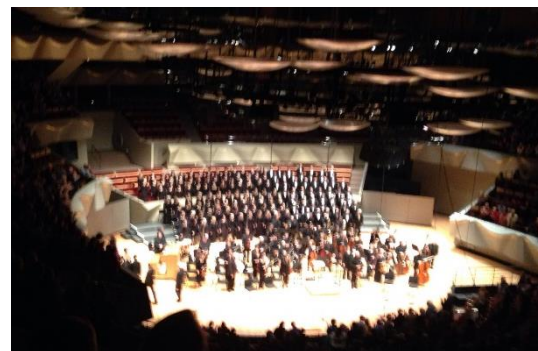
Representatives captured one of the many presentations available at the conference.

There were also classes that covered a variety of areas including music, poetry, film, yoga, and dance. From the PSU Honors College, both class representatives, executives, Dr. Fuchs, as well as any others interested took the trip to the conference for the five days.