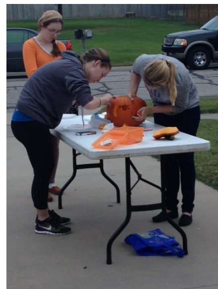
Members of the honors college work together to carve the best pumpkin possible to win the title of champion at the HCA pumpkin carving event.