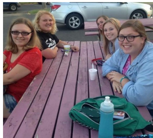
One of the Peer Mentor groups meets.

Even the most extreme personality traits could not keep the harmony out of the groups, because conflict is not what the mentors are there for. Peer mentors sign up with the intention of helping newcomers, no matter the person, and are always happy to be of service. Many of the freshmen realize this, and it has inspired many of them to apply to become peer mentors in 2015-2016. By doing so, the freshmen of this year can continue the tradition as the sophomores of next year.