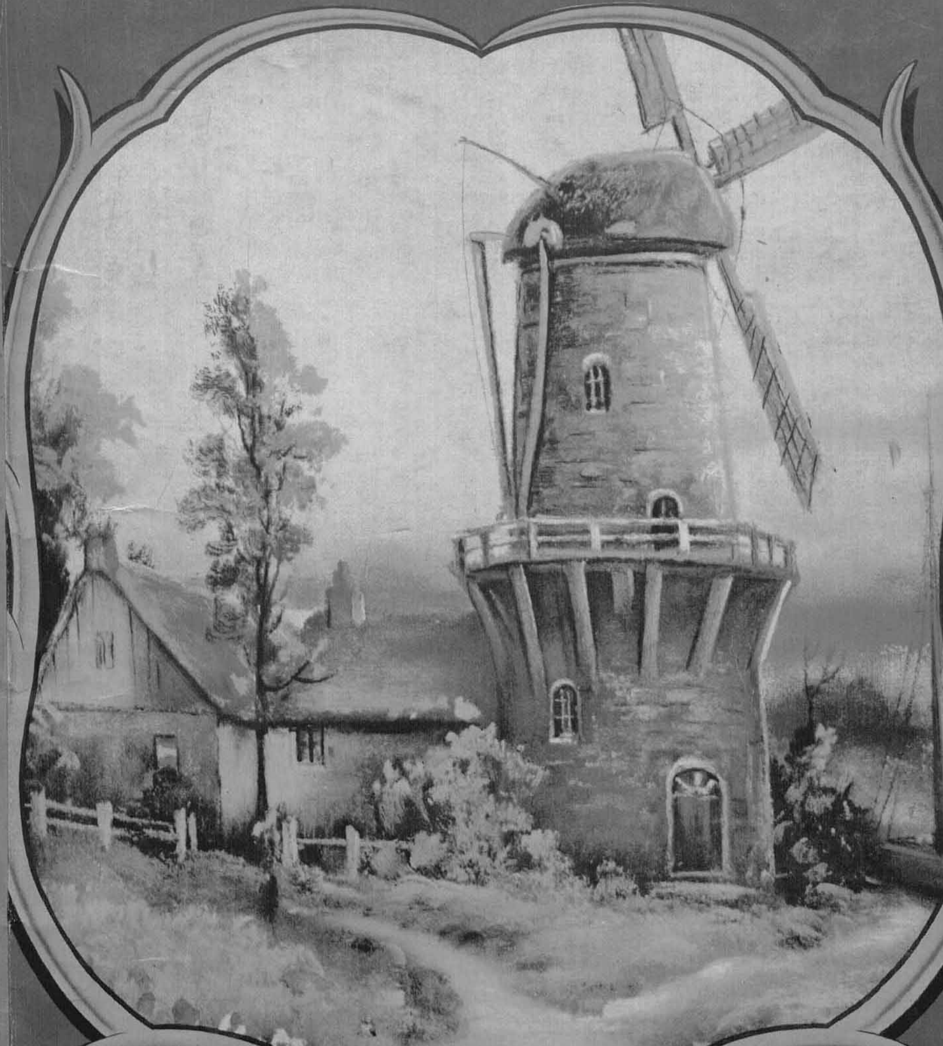
OLD DUTCH MILL