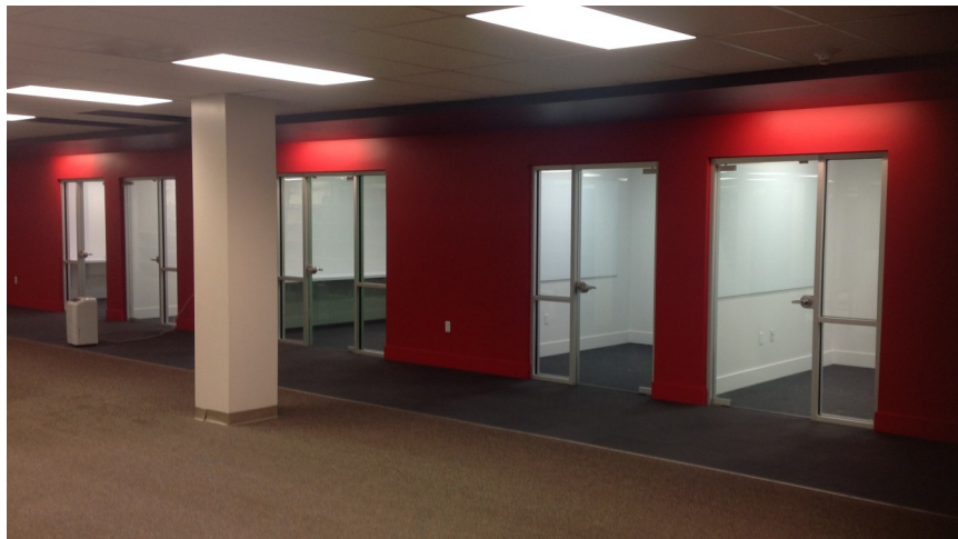
Study rooms and media studios for student use in the remodeled section of the basement.

The 3rd floor is the next phase of the Library remodel and will begin May 12th with an anticipated completion by start of Fall 2017 semester. The 3rd floor remodel will add 8 small group study rooms that can be reserved. We expect to add 150 seats to the third floor, in addition to the study rooms.