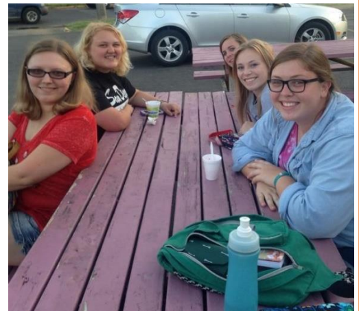
One of the Peer Mentor groups meets.

Even the most extreme personality traits could not keep the harmony out of the groups, because conflict is not what the mentors are there for. Peer mentors sign up with the intention of helping newcomers, no matter the person, and are always happy to be of service. Many of the freshmen realize this, and it has inspired many of them to apply to become peer mentors in 2015-2016. By doing so, the freshmen of this year can continue the tradition as the sophomores of next year.