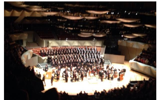
Representatives captured one of the many presentations available at the conference.

There were also classes that covered a variety of areas including music, poetry, film, yoga, and dance. From the PSU Honors College, both class representatives, executives, Dr. Fuchs, as well as any others interested took the trip to the conference for the five days.